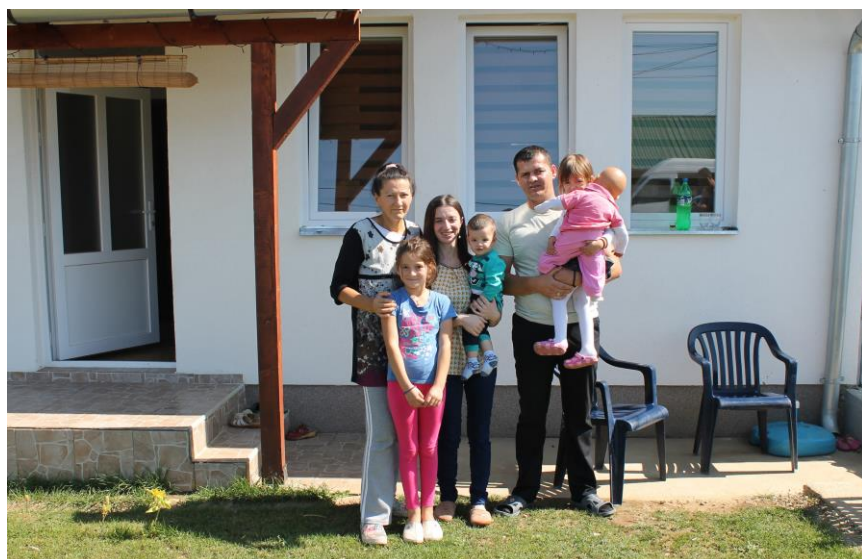
Voluntary returnee family near Pristina