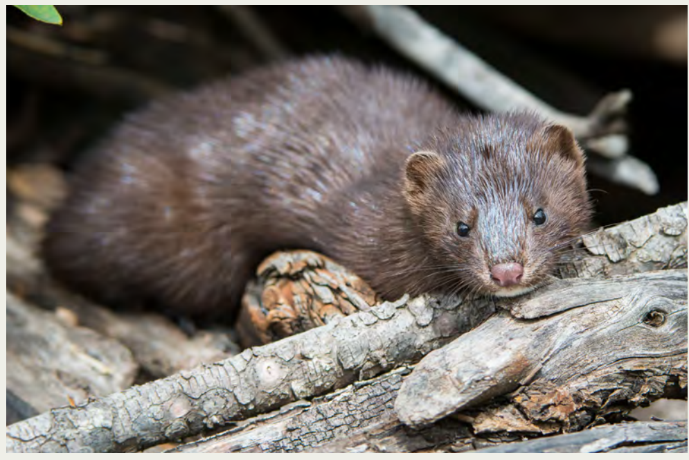
American mink (Hinton, Alberta)