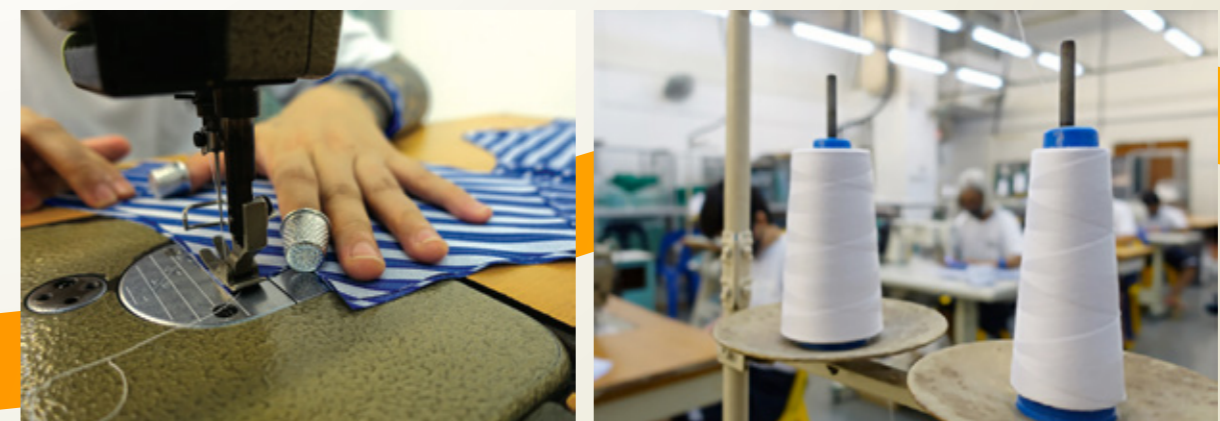
Female inmates from Institution A4 and residents of Selarang Halfway House collectively crafted 1,400 mask pouches for beneficiaries at Rainbow Centre Singapore

In collaboration with CapitaLand Hope Foundation, female inmates and residents of Selarang Halfway House (SHWH) collectively crafted 1,400 mask pouches for beneficiaries at Rainbow Centre Singapore. Teaming up with CYC Made to Measure, they also produced over 1,600 reusable masks which were distributed to migrant workers. In addition, SHWH residents packed appreciation packs which were delivered by ravehearts SRM Services Pte Ltd to dormitories, expressing gratitude to frontline cleaners among the migrant worker community.