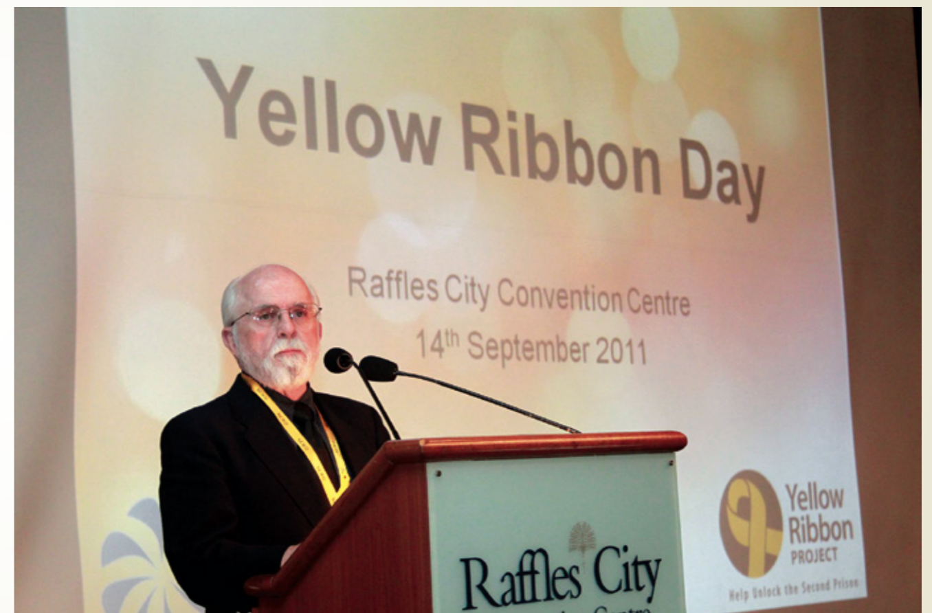
Yellow Ribbon Day where about 130 community partners and representatives from CARE Network gathered to discuss community reintegration issues related to aftercare

At the 13 th International Corrections and Prisons Association (ICPA) Conference held in Singapore, 14 September was designated as the "Yellow Ribbon Day", where about 130 community partners and representatives from CARE Network gathered to discuss community reintegration issues related to aftercare.