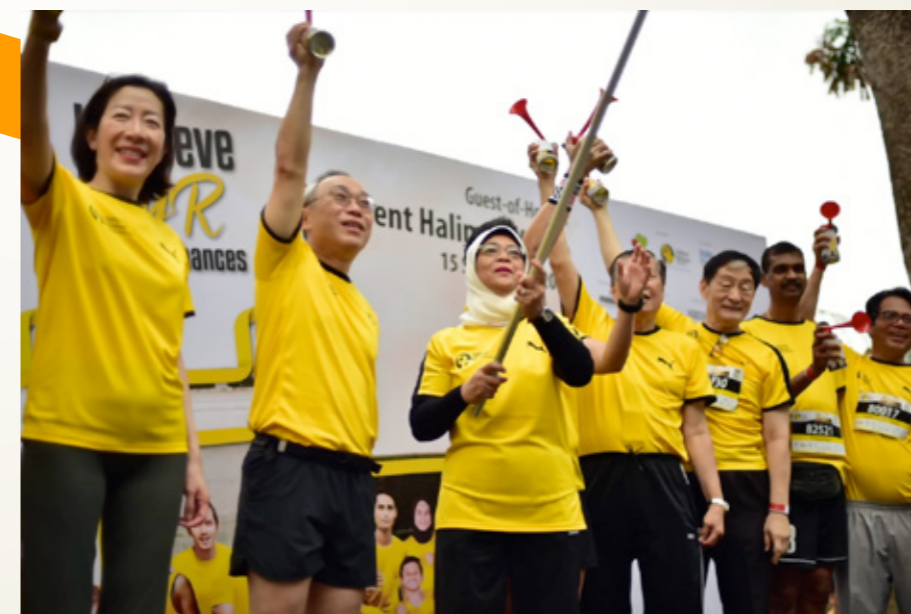
/ The 11 th edition of the Yellow Ribbon Prison Run received the esteemed presence of then President of Singapore, Mdm Halimah Yacob

The 11 th edition of the Yellow Ribbon Prison Run received the esteemed presence of Singapore's then President, Mdm Halimah Yacob. A remarkable 10,000 participants ran the distance, symbolising their endorsement of second chances. As part of the Reach Out project, a collaborative effort involving the National Day Parade 2019 Celebration Outreach Committee, Yellow Ribbon Project, and Very Special Arts (VSA) Singapore, inmates had the opportunity to give back to society by packing 50,000 goodie packs for National Day.