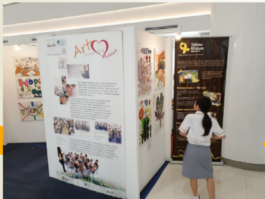
/ Palm View Primary School Art Exhibition

Since 2015, Palm View Primary School has integrated the Yellow Ribbon Project into its Community Involvement Programme. Through their Artizenry Programme, they have forged a partnership with the Yellow Ribbon Project to create paintings aimed at fundraising for the Yellow Ribbon Fund. This initiative, a component of the school curriculum, instils empathy in students by fostering a deeper comprehension of the Yellow Ribbon Project's mission. In a demonstration of solidarity for second chances, 220 Primary 3 students collaborated in teams to produce paintings. These artworks were showcased at the "Art from the Heart" exhibition held at Buangkok Square Mall, showcasing the students' support for the cause of rehabilitation and societal reintegration.