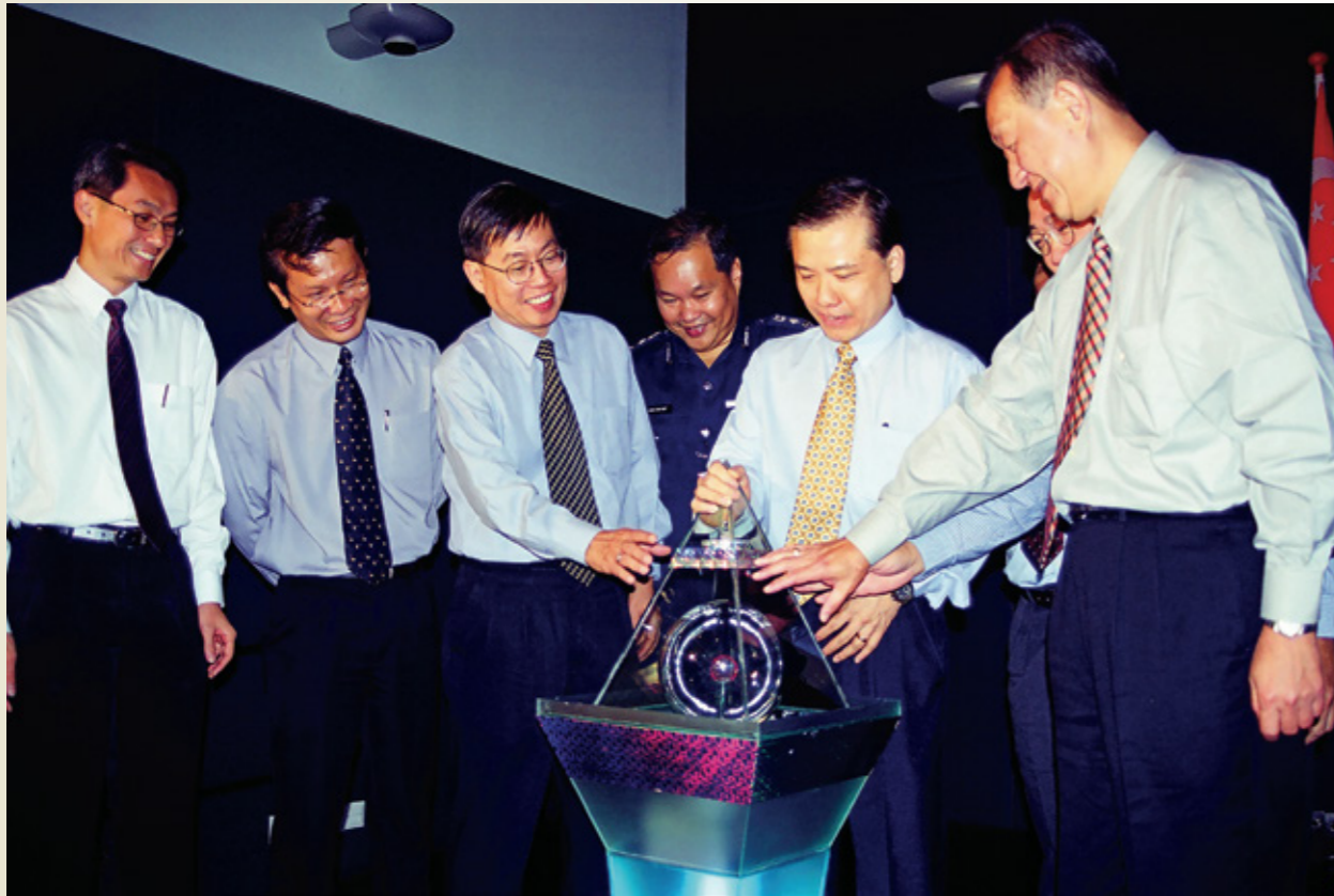
/ Launch of CARE Network

The CARE Network was formed to bring together agencies in the aftercare landscape, to develop a coordinated approach towards supporting the rehabilitation and reintegration of ex-offenders, and to help them transit back into the community as contributing citizens. The founding members of the CARE Network were MHA, SPS, SCORE, National Council of Social Services (NCSS), Singapore Aftercare Association (SACA), Singapore Anti-Narcotics Association (SANA) and Industrial and Services Co-operative Society Ltd (ISCOS). The Ministry of Community Development, Youth and Sports (MCYS) joined in 2006. SPS took on the role as the CARE Network Secretariat.