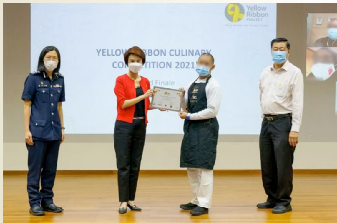
/ The grand finale of the Yellow Ribbon Culinary Competition 2021, graced by Ms Low Yen Ling, Minister of State for Trade and Industry and Minister of State for Culture, Community and Youth

The Yellow Ribbon Culinary Competition was organised to provide inmates with valuable skills training relevant to the F&B industries, ultimately enhancing their employability upon release. Co-organised in collaboration with the Singapore Chefs' Association, the event's theme, "Recipe for Change", drew inspiration from the community's resilience amid the pandemic's disruptions and the inmates' determination to forge their own paths in rehabilitation. Despite the challenges posed by the pandemic, the Yellow Ribbon Culinary Competition garnered vital support from key community partners like Aquaculture Centre of Excellence Pte Ltd, Thai Sing Foodstuffs Industry Pte Ltd, and Sphere Consumer Products Asia Pte. Ltd., who generously sponsored ingredients and food packaging for the event.