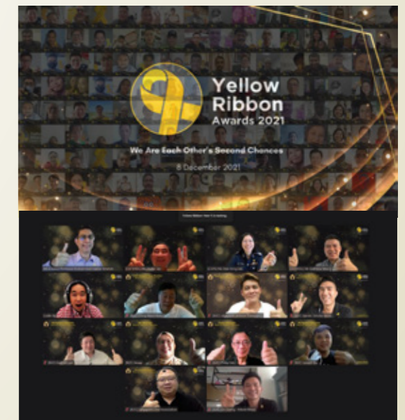
/ The Yellow Ribbon Awards Ceremony themed “We Are Each Other’s Second Chances”

The Yellow Ribbon Awards Ceremony (YRAC), themed “We Are Each Other’s Second Chances”, acknowledged the efforts of employers, community partners, ex-offenders, and volunteers in promoting second chances for inmates and those reintegrating into society. YRAC also saw the consolidation of two previous award ceremonies - the SCORE Appreciation Award Ceremony and the Yellow Ribbon Celebrating Second Chances Award Ceremony.