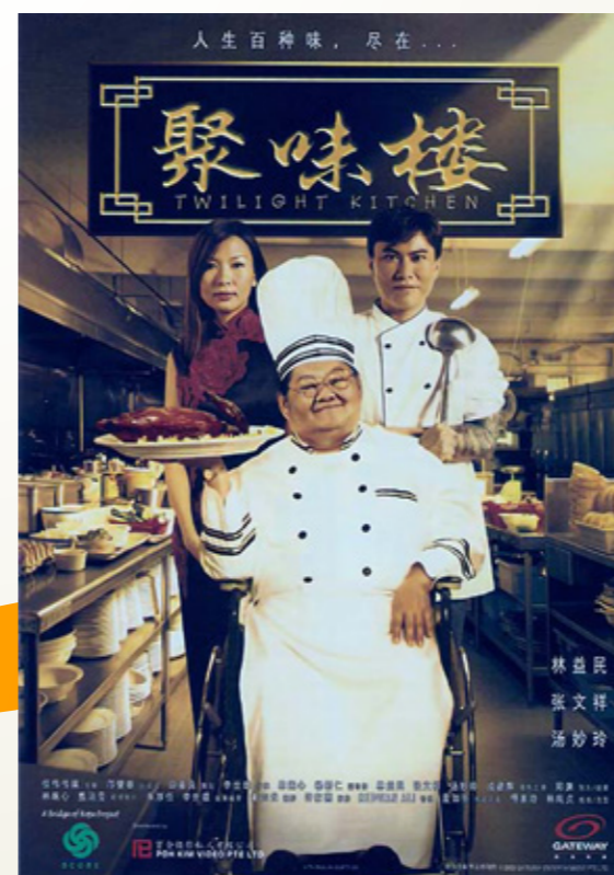
/ Twilight Kitchen (聚味楼 in Mandarin) community film

As part of CARE Network’s efforts to educate the public on the struggles faced by ex-offenders in their reintegration journey, SCORE commissioned a film, titled “ Twilight Kitchen ” (聚味楼 in Mandarin), which was screened in cinemas in 2003. The objective was to encourage companies to employ ex-offenders.