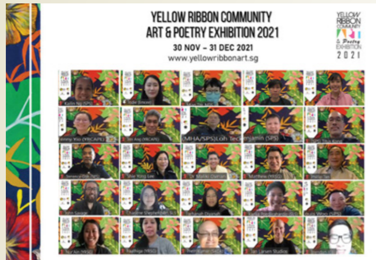
/ Yellow Ribbon Community Art & Poetry Exhibition in 2021

total fundraising amount of $4,446 for YRF. 2021 also marked the inaugural collaboration between YRP and CANVAS, a support group established in 2019 specifically for ex-offenders who had undergone training in visual arts programmes during their time behind bars. This partnership offered new avenues for artistic expression and support for those seeking to rebuild their lives after incarceration.