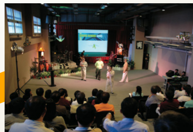
/ Yellow Ribbon Fund’s “Dining Behind Bars”

Yellow Ribbon Fund’s “Dining Behind Bars” raised $54,000 through generous donations from Bukit Panjang Government High School, NTUC Foodfare, ISCOS, NCSS, and Rotary Club of Queenstown.