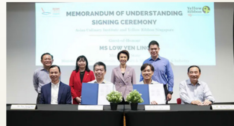
An MOU was signed between YRSG and Nanyang Polytechnic's Asian Culinary Institute (NYP-ACI)

An MOU was signed between YRSG and Nanyang Polytechnic's Asian Culinary Institute (NYP-ACI) to enhance employment opportunities for inmates and ex-offenders in the food services industry.