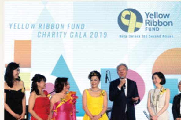
The Yellow Ribbon Fund Charity Gala was graced by Senior Minister and Coordinating Minister for National Security, Mr Teo Chee Hean

The Yellow Ribbon Fund Charity Gala achieved a record-breaking fundraising of amount $1.8 million. The event, attended by 700 guests, was graced by Senior Minister and Coordinating Minister for National Security, Mr Teo Chee Hean. In addition, then Senior Minister of State, Ministry of Communications and Information and Ministry of Culture, Community and Youth, Ms Sim Ann, unveiled the Yellow Ribbon Community Art & Poetry Exhibition during the gala. Themed “Moving Forward Together”, the exhibition showcased 100 artworks and 23 poems created by inmates.