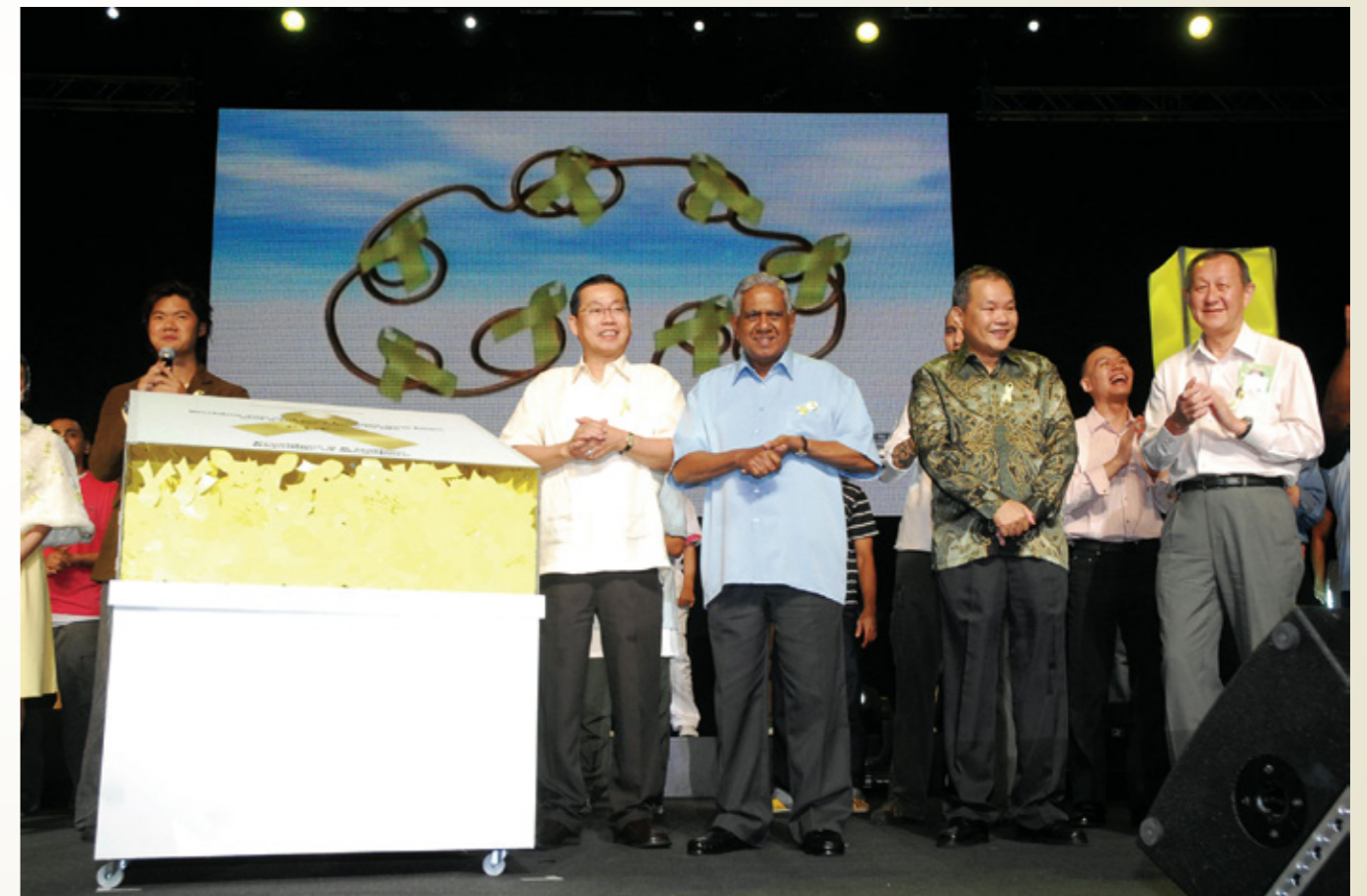
/ The Second Yellow Ribbon Charity Concert in 2006

In 2006, an audience of 6,000 and 50,000 home viewers watched the second Yellow Ribbon Charity Concert, also attended by Mr S. R. Nathan.