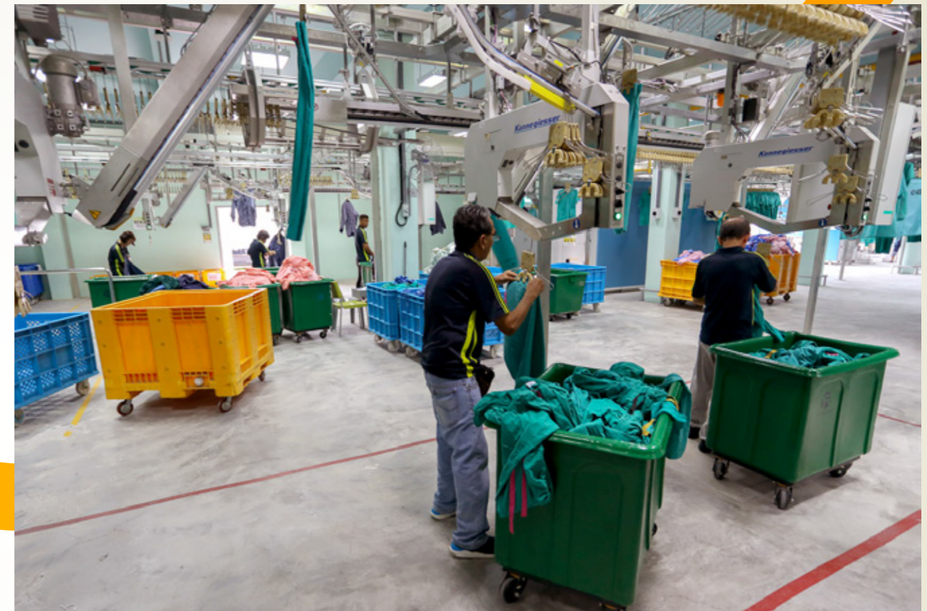
Set up of new external laundry facility

SCORE set up a new external laundry facility to help broaden transitional employment opportunities for ex-offenders.