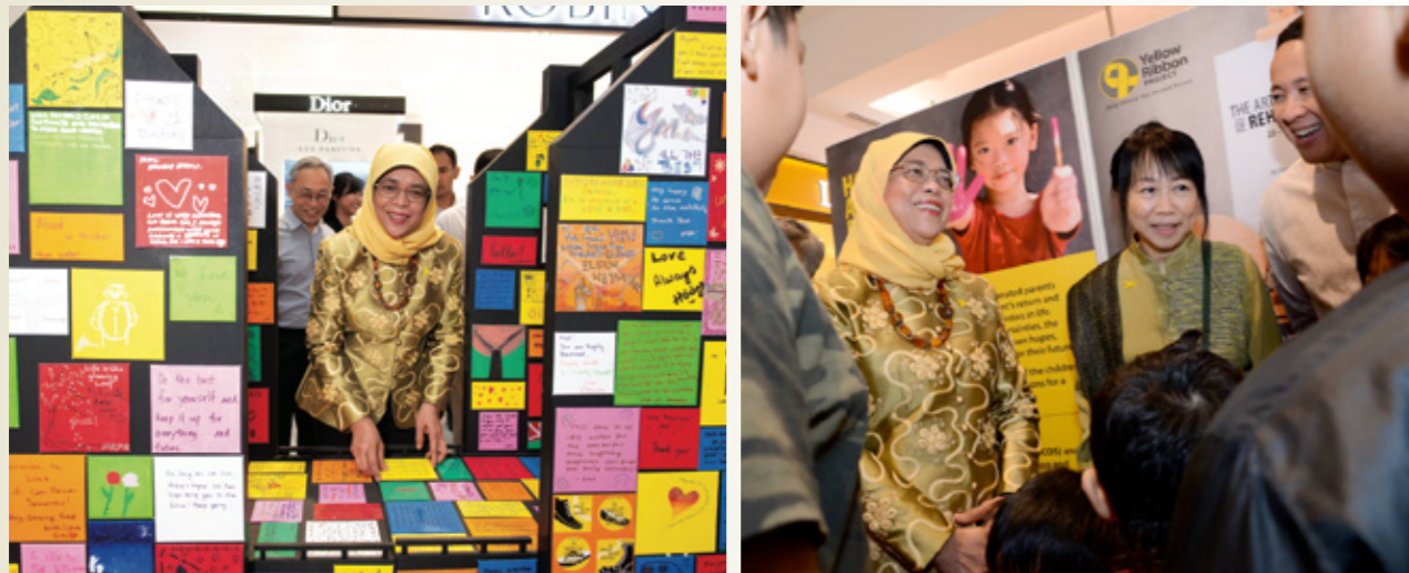
/ The Yellow Ribbon Community Art Exhibition received an honoured visit from then President of Singapore, Mdm Halimah Yacob

Celebrating nine years of partnership between the Yellow Ribbon Project and the Singapore Art Museum, the Yellow Ribbon Community Art Exhibition held at Raffles City Singapore received an honoured visit by then President of Singapore, Mdm Halimah Yacob. Under the theme “Transitions: Crossroads & Choices”, the exhibition showcased 78 artworks, representing the culmination of a year-long collaboration between inmates and their artist mentors.