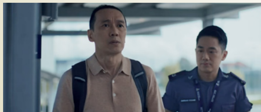
/ Screenshot of the Yellow Ribbon Project brand video, titled “We Are Each Other’s Second Chances”

The Yellow Ribbon Project brand video, titled “We Are Each Other’s Second Chances”, was introduced. As of 2021, over 400 ex-offenders and 800 community partners have actively contributed to various Yellow Ribbon Project events and activities. The CARE Network aspires for increased engagement from individuals and organisations, fostering support for the meaningful cause of reintegrating ex-offenders and building an inclusive society.