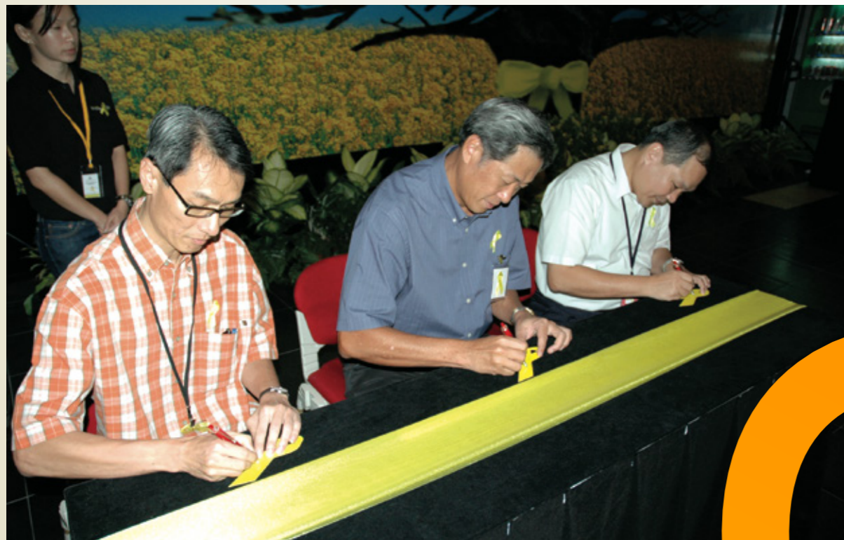
(Pictures from the top to bottom) Dr Vivian Balakrishnan, then Minister for Community Development, Youth and Sports and Second Minister for Trade and Industry at the Yellow Ribbon Conference; Dr Ng Eng Hen, then Minister for Manpower and Second Minister for Education graced the Yellow Ribbon Job Fair