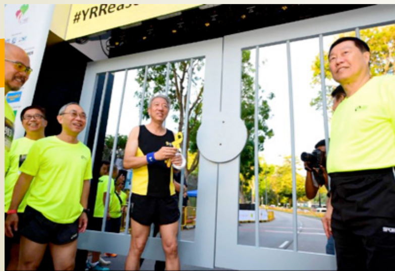
The 9 th Yellow Ribbon Prison Run was flagged off by then Deputy Prime Minister and Coordinating Minister for National Security, Mr Teo Chee Hean