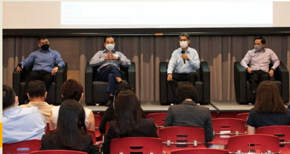
/ Dialogue during YR Connects 2022

Over 30 key industry stakeholders comprising trade associations and employers attended the dialogue, which allowed participants to bridge different perspectives and build consensus on the best practices to support ex-offenders. As part of the dialogue, YRSG also outlined its employment support initiatives over the next few years, such as the TAP (Train and Place) & Grow initiative.