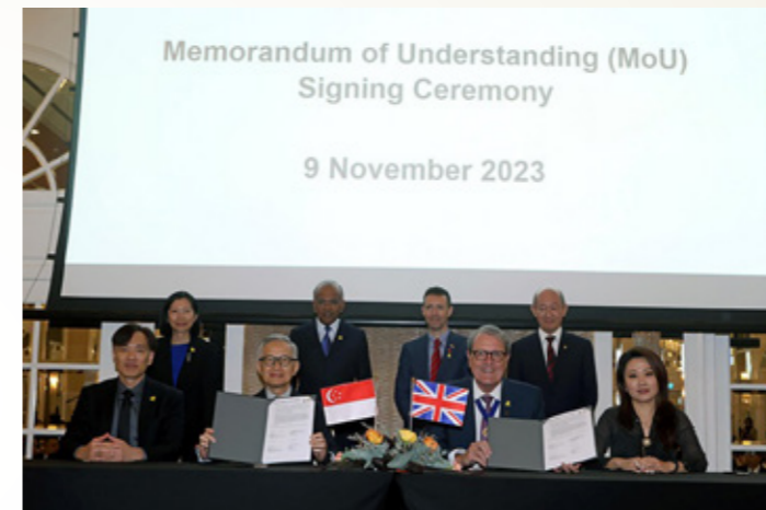
An MOU was signed between the Institute of Chartered Accountants in England and Wales South East Asia Limited and Yellow Ribbon Fund

An MOU was signed between the Institute of Chartered Accountants in England and Wales South East Asia Limited and Yellow Ribbon Fund, with the aim of providing professional certification and career opportunities in the accountancy industry for the family members of inmates and ex-offenders in Singapore.