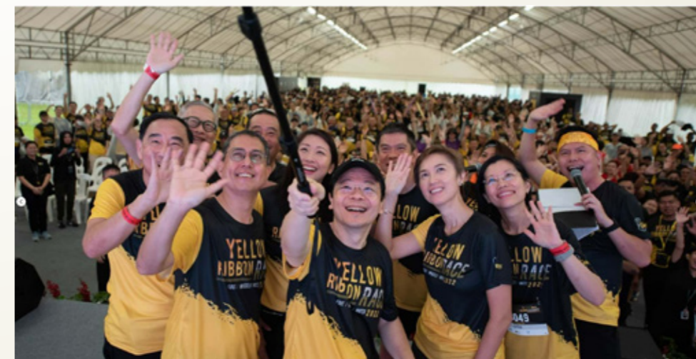
/ Deputy Prime Minister and Minister for Finance, Mr Lawrence Wong, was the Guest-of-Honour for the Yellow Ribbon Race 2022