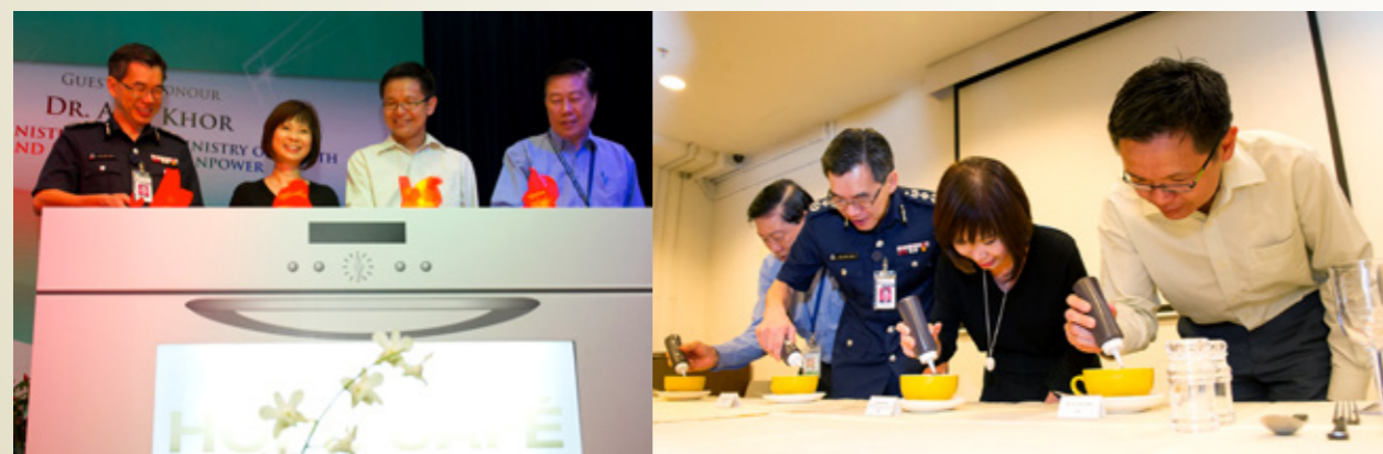
Official opening of Hope Cafe - Training Kitchen and Restaurant