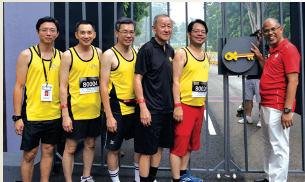
The 7 th Yellow Ribbon Prison Run was flagged off by then Second Minister for Home Affairs and Second Minister for Foreign Affairs, Mr Masagos Zulkifli

The 7 th Yellow Ribbon Prison Run was flagged off by then Second Minister for Home Affairs and Second Minister for Foreign Affairs, Mr Masagos Zulkifli. The run garnered participation from over 7,000 runners and raised $85,000. Then President of Singapore, Dr Tony Tan Keng Yam, attended the Yellow Ribbon Fund Charity Gala as the Guest-of-Honour, raising $920,072.