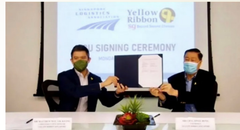
/ YRSG and the Singapore Logistics Association signed an MOU to enhance the career prospects of inmates and ex-offenders in the logistics industry

YRSG and the Singapore Logistics Association signed an MOU that signalled the intent to enhance the career prospects of inmates and ex-offenders in the logistics industry.