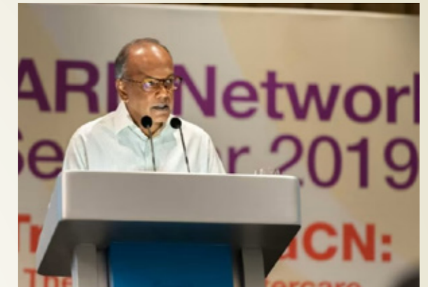
/ Mr K Shanmugam, Minister for Home Affairs and Minister for Law, giving the opening speech at the CARE Network Seminar

The CARE Network organised a seminar with the theme “ TransformaCN: The Future of Aftercare ”. More than 300 aftercare professionals and 70 partner agencies participated, expressing their dedication to move beyond the two-year recidivism rate and work collectively towards reducing the five-year recidivism rate.