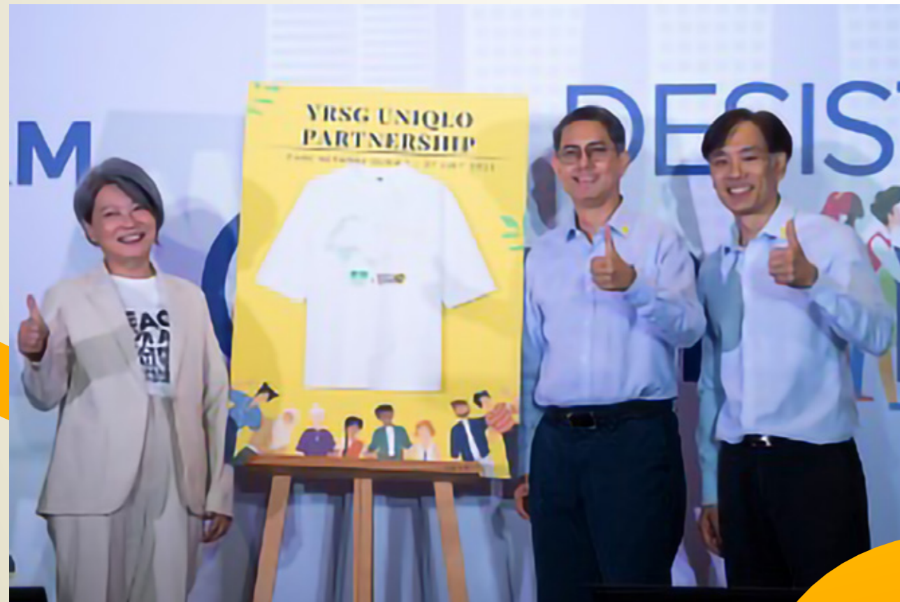
/ Partnership between YRSG and Uniqlo Singapore announced during CARE Network Summit 2023

The 2023 CARE Network Summit focused on the concept of desistance, exploring the nature of the journey towards cessation of certain behaviours. Discussions revolved around what this journey might entail and how communities could provide support to individuals undergoing this process. The summit brought together community leaders, researchers, and partners to share insights and collaborative initiatives. During the summit, a partnership between YRSG and Uniqlo Singapore was announced . This partnership aimed to distribute pre-loved clothing to vulnerable communities, specifically targeting residents from the Selarang Halfway House. This initiative sought to provide support and resources to those in need within these communities.