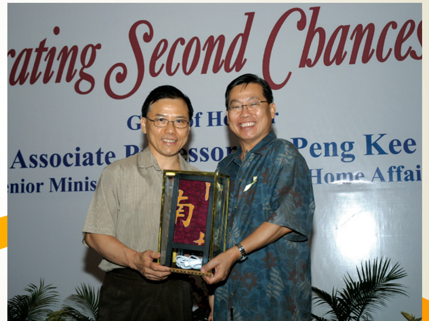
Associate Professor Ho Peng Kee, then Senior Minister for State, Ministry of Law and Ministry of Home Affairs gracing the inaugural Celebrating Second Chances Awards Ceremony

The inaugural Celebrating Second Chances Awards Ceremony aimed to motivate ex-offenders who have stayed crime and drug-free. They received commendations recognising their achievements at the event.