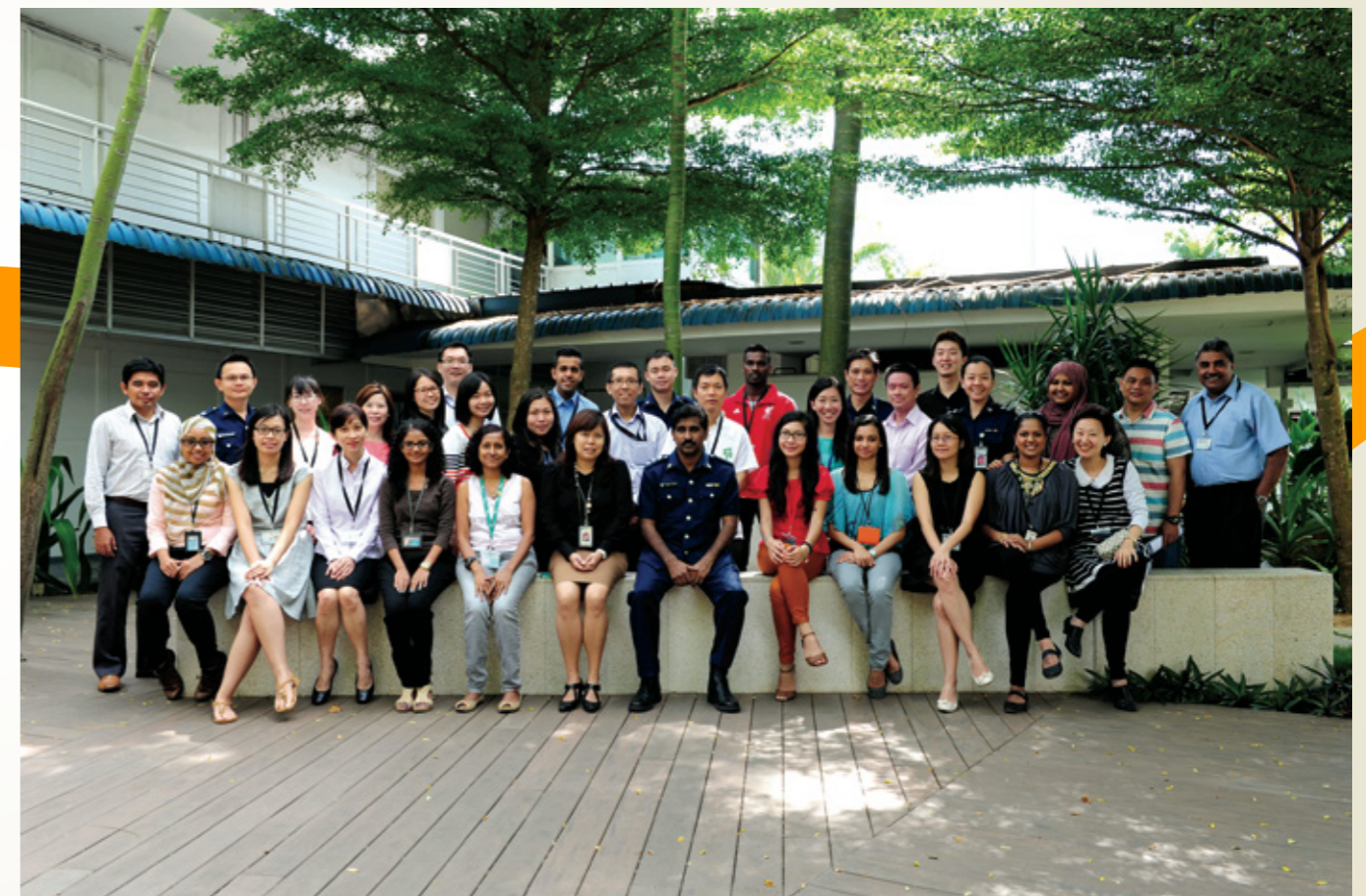
The Inaugural CARE Network Workplan Seminar

The inaugural CARE Network Workplan Seminar brought together 220 participants from 56 VWOs, religious organisations, community groups and government agencies to discuss the strategies for strengthening throughcare. It also provided opportunities for knowledge-sharing and networking between the CARE Network partners.