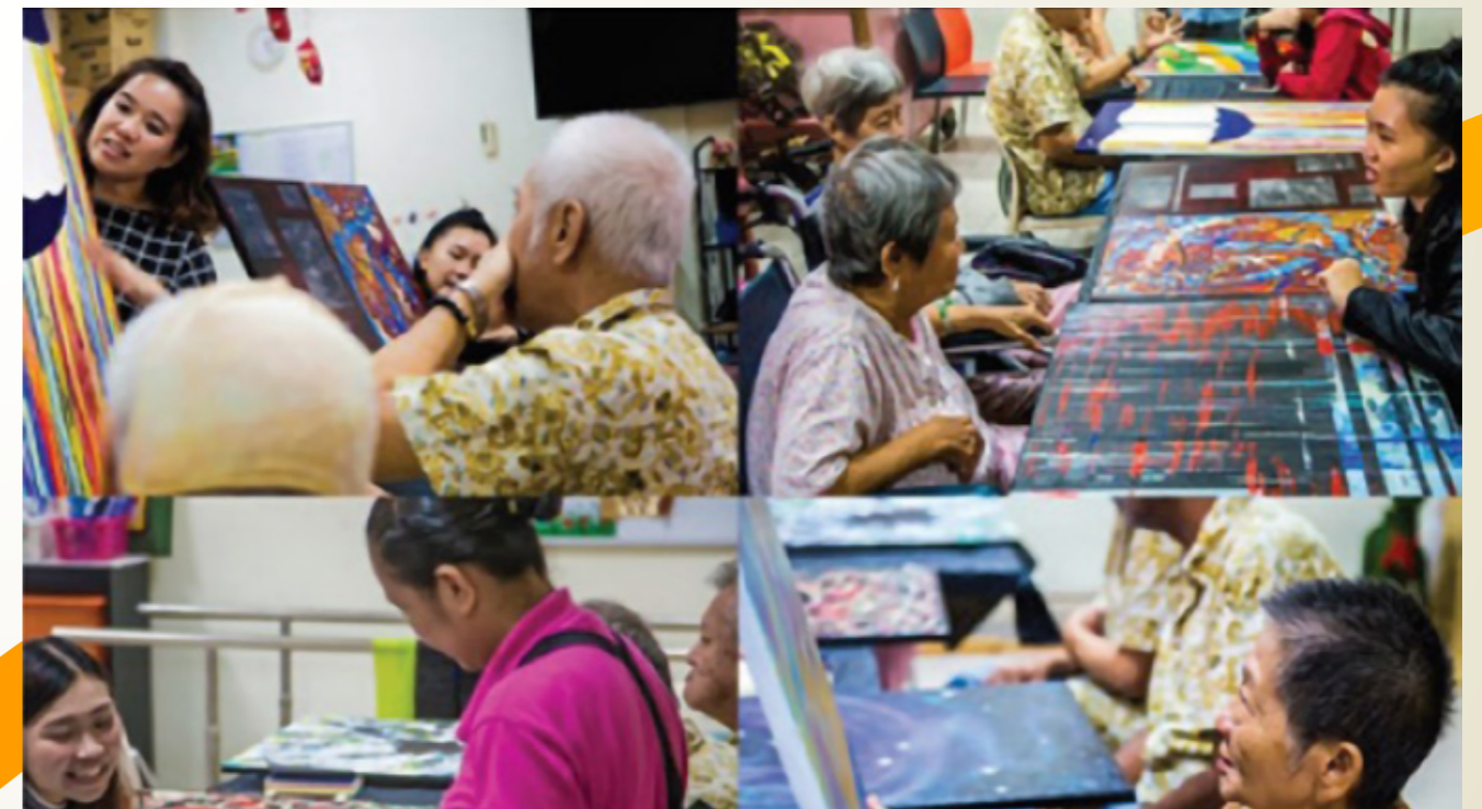
/ Pairing inmate artists from the Visual Arts Hub in prison with elderly residents from the United Medicare Centre (UMC) as "paint-pals"

Yellow Ribbon Project collaborated with the Global Cultural Alliance (GCA) to launch an interactive art initiative. This unique endeavour involved collaborative efforts, pairing inmate artists from the Visual Arts Hub in prison with elderly residents from the United Medicare Centre (UMC) as "paint-pals" to exchange their artistic creations. GCA facilitated the project by enlisting a digital technology partner to educate inmates on incorporating augmented reality elements into their artworks. The resulting pieces were showcased at GCA's gallery and later exhibited at YRP's roadshow at The Star Vista. This collaboration aimed to provide avenues for both communities, despite their diverse backgrounds, to make meaningful contributions to society. By fostering a creative exchange of ideas through this interactive art platform, it brought together these distinct communities for a powerful and shared experience.