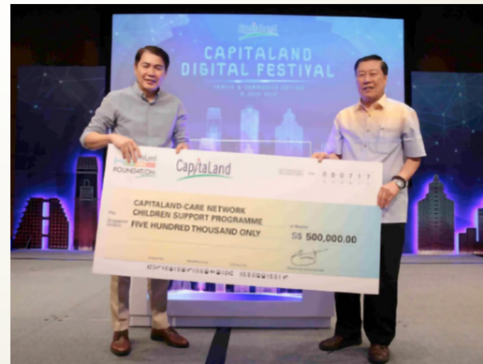
/ Cheque presentation for CapitaLand-Yellow Ribbon Fund Children Support Programme

CapitaLand-Yellow Ribbon Fund Children Support Programme was piloted with the aim of reducing intergenerational offending and to rally agencies to come forward in supporting the well-being of inmates’ and ex-offenders’ children.