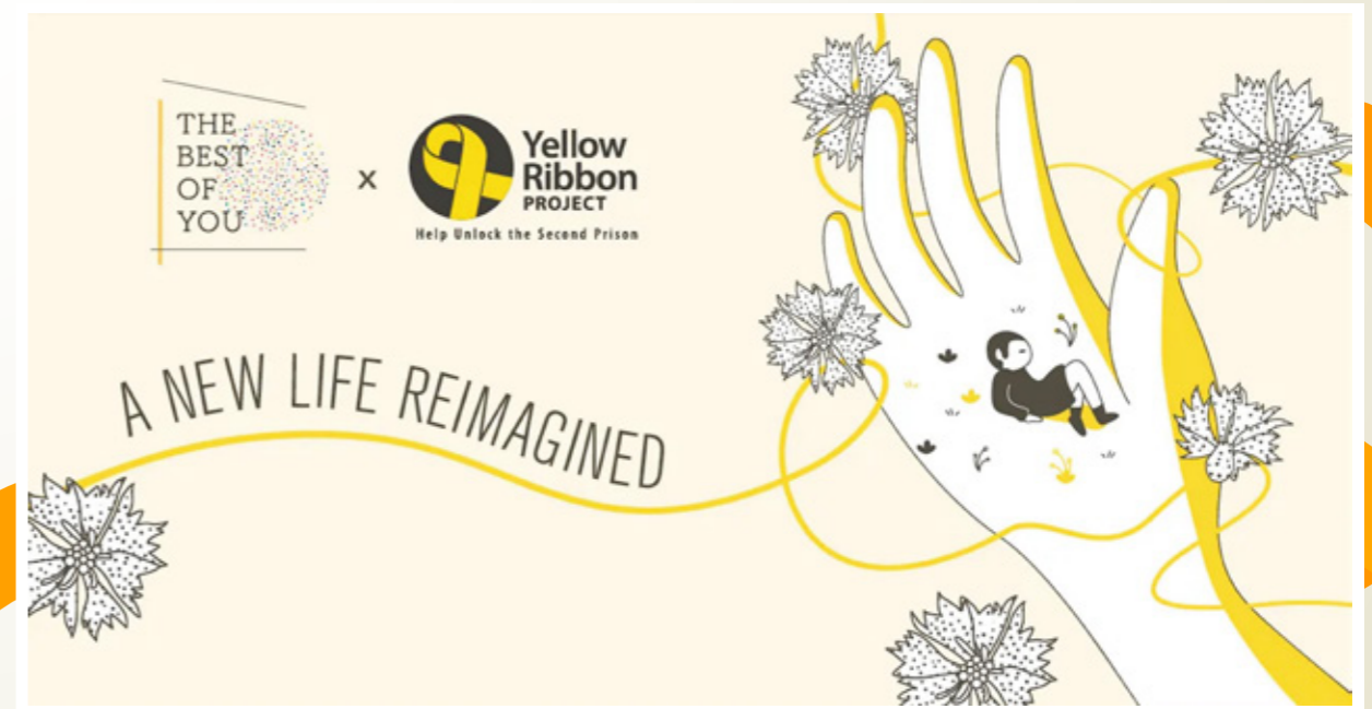
/ Julie’s “Best of You” Yellow Ribbon Project Exhibition