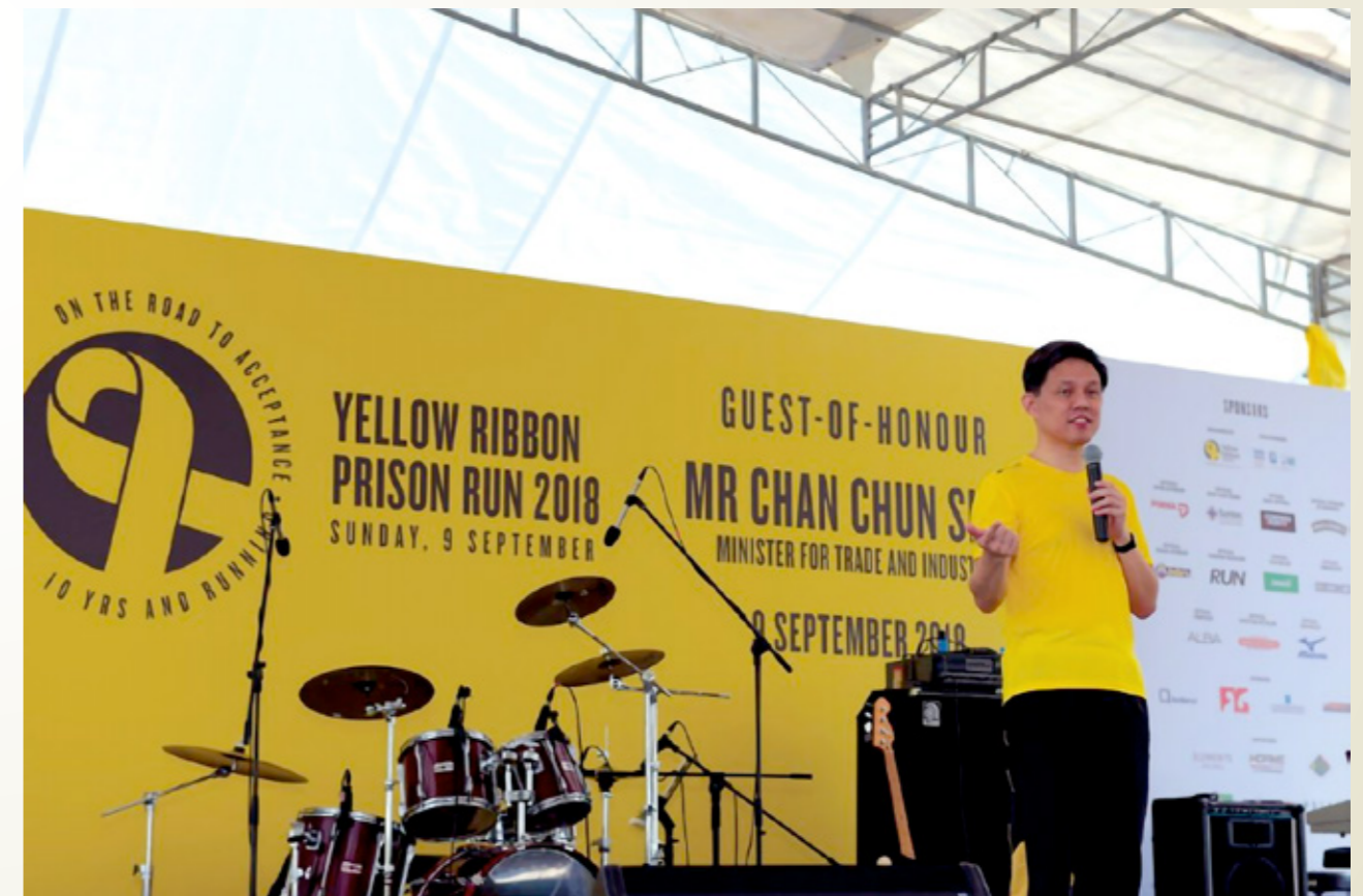
Mr Chan Chun Sing, then Minister for Trade and Industry was the Guest-of-Honour for the 10 th Yellow Ribbon Prison Run

Since its inception in 2009, the Yellow Ribbon Prison Run has raised over $1 million for the Yellow Ribbon Fund, contributing to programmes and services aimed at supporting ex-offenders and their families. The Yellow Ribbon Prison Run in 2018 had Mr Chan Chun Sing, then Minister for Trade and Industry, as the Guest-of-Honour for the event.