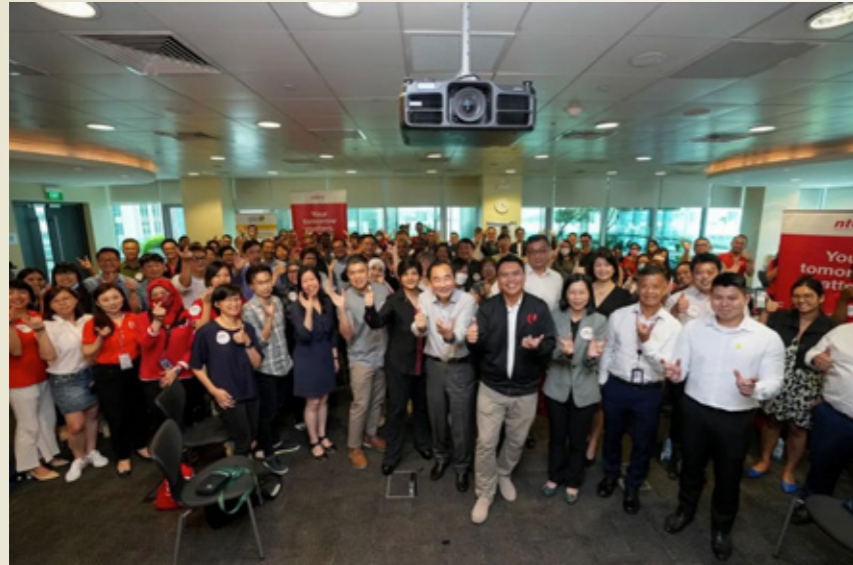
Participants' group photo during YR Connects x EveryWorkerMatters Conversations

Over 80 partner employers, partners from trade associations and social service agencies shared their thoughts, challenges faced and ideas to achieve a more inclusive workforce that supports second chances.