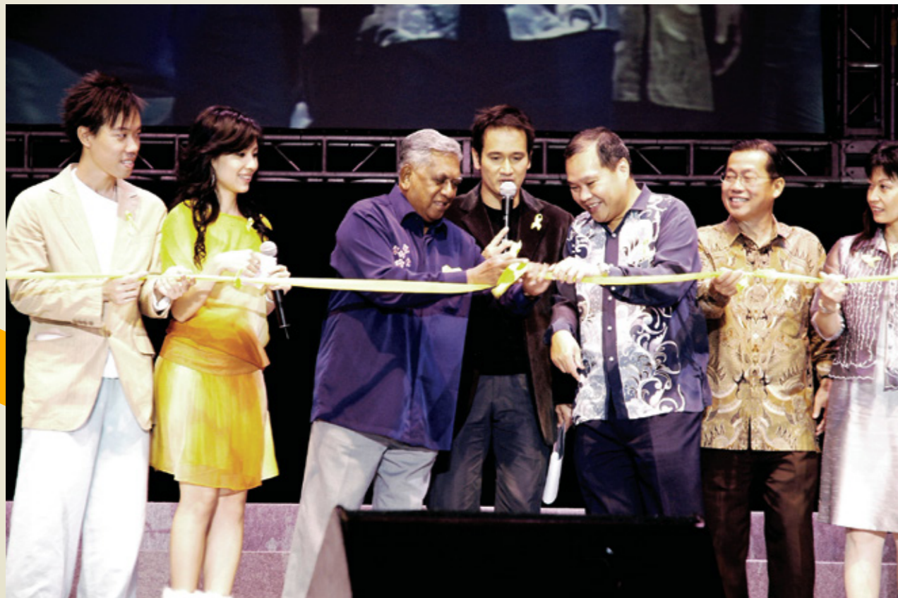
/ Then President of Singapore, Mr S.R. Nathan, launched the Yellow Ribbon Project (YRP) and Yellow Ribbon Fund (YRF) during the Yellow Ribbon Charity Concert 2004

A YRP theme song, which was a remix of the 1970s song, “Tie a Yellow Ribbon Round the Ole Oak Tree”, that inspired the name “ Yellow Ribbon Project ”, was also produced for the launch.