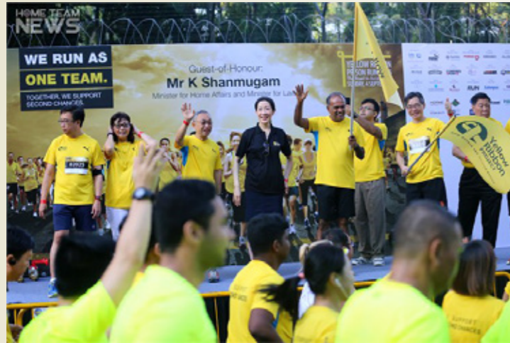
/ The 8 th Yellow Ribbon Prison Run, which was flagged off by Minister for Home Affairs and Minister for Law, Mr K Shanmugam

More than 9,000 people took part in the 8 th Yellow Ribbon Prison Run, which was flagged off by Minister for Home Affairs and Minister for Law, Mr K Shanmugam.