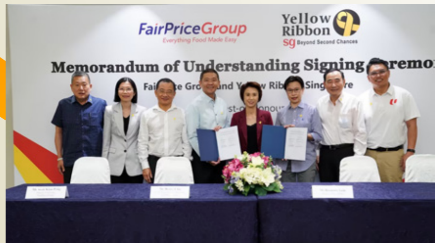
An MOU was signed between YRSG and FairPrice Group

An MOU was signed between YRSG and FairPrice Group, with the aim of providing employment with training opportunities and career development support for ex-offenders in the food services, logistics and retail sectors.