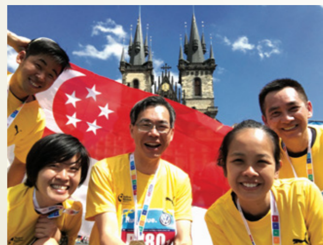
/ Yellow Ribbon Run in Prague

Singapore’s Yellow Ribbon Prison Run inspired the Czech Republic’s Prison Service to organise its own Yellow Ribbon Run as part of the Prague International Marathon.