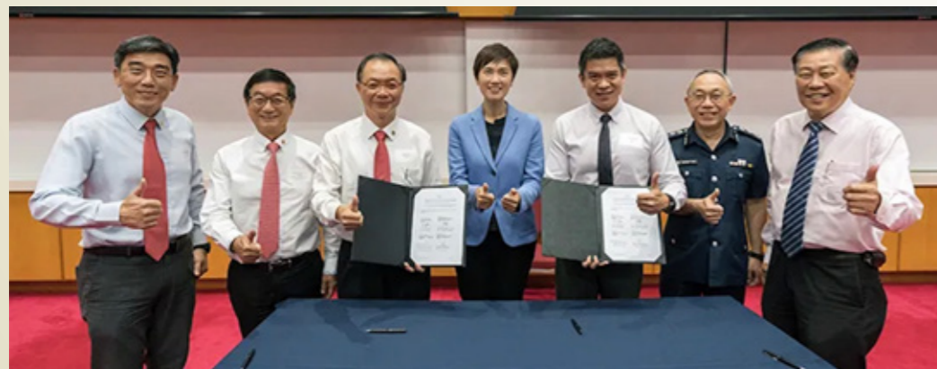
SCORE signed a Memorandum of Understanding with the Singapore Precision Engineering and Technology Association

SCORE signed a Memorandum of Understanding (MOU) with the Singapore Precision Engineering and Technology Association (SPETA). The MOU aimed to boost the employability potential of inmates in the Precision Engineering industry through training and job placement.