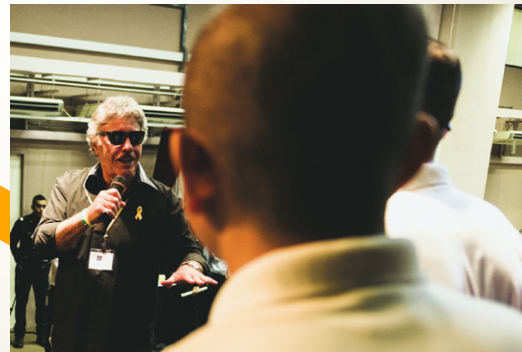
Mr Tony Orlando, singer of the song called “Tie a Yellow Ribbon Round the Ole Oak Tree”, visited inmates from the Performing Arts Centre at Institution A5

The Yellow Ribbon Project was inspired by a hit song from the 1970s, “ Tie a Yellow Ribbon Round the Ole Oak Tree ”. Mr Tony Orlando, singer of the song, visited inmates from the Performing Arts Centre at Institution A5 and shared about the importance of second chances and new beginnings in life.