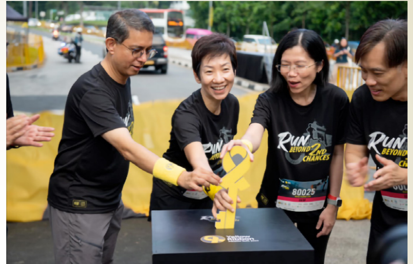
/ Minister for Sustainability and the Environment, Ms Grace Fu, was the Guest-of-Honour for the Yellow Ribbon Prison Run 2023