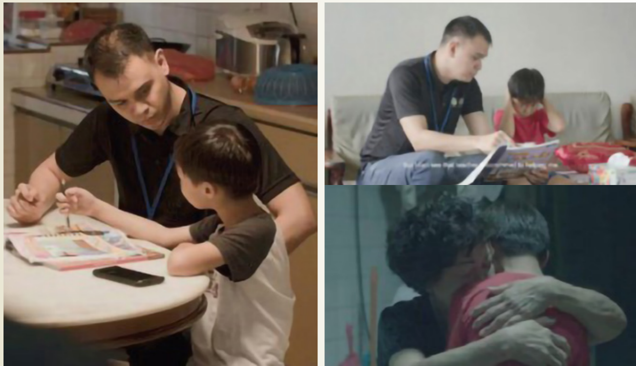
/ Impactful videos centering on the influence of initiatives within the CARE Network

Yellow Ribbon Project forged a partnership with LASALLE College of the Arts to enhance digital outreach and bolster its online visibility. Together, they crafted impactful videos publicising initiatives within the CARE Network. These videos served to broaden their online audience by shedding light on the obstacles confronting ex-offenders and their families. The aim was to inspire viewers to contribute meaningfully to the lives of these beneficiaries and collectively foster an inclusive society. These beneficiary-focused videos were shared across various social media platforms, accumulating close to 3,000 views.