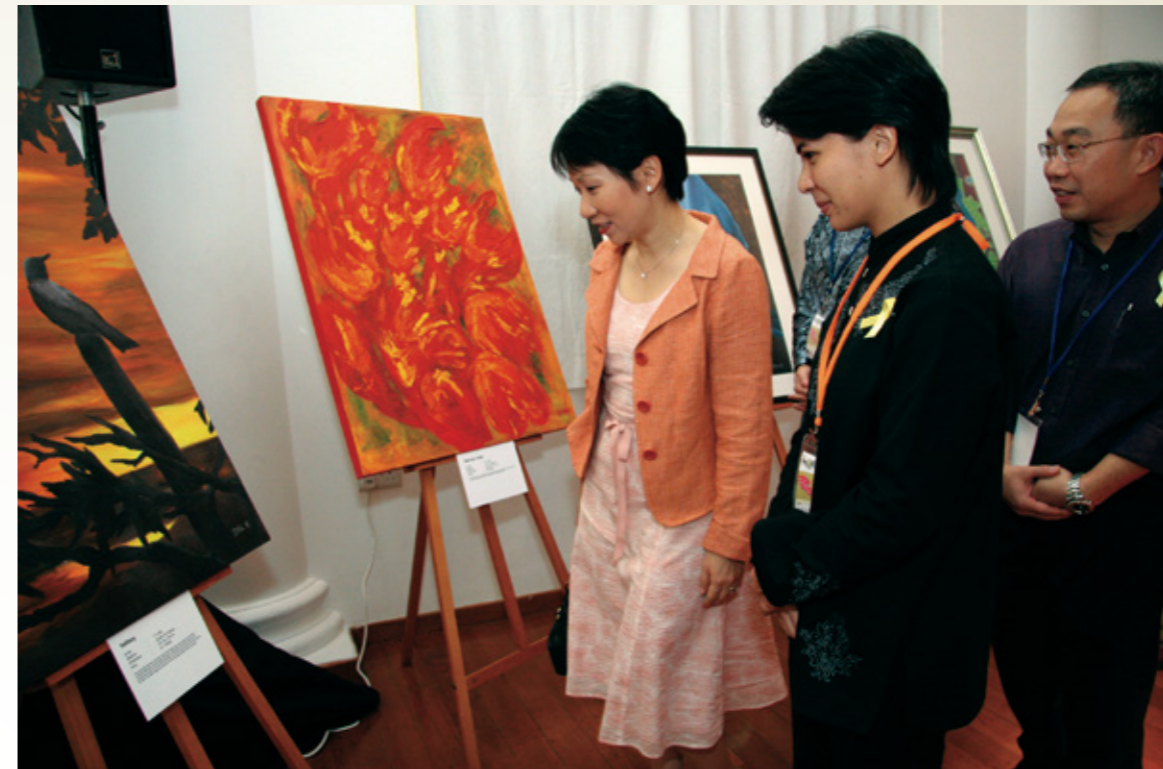
/ Then Minister of State, Ministry of National Development, Ms Grace Fu, viewing the artwork done by the inmates