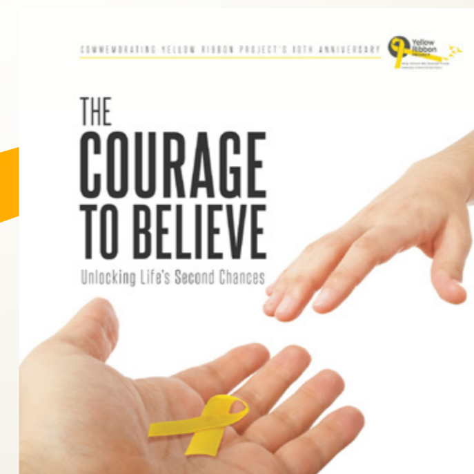
/ The Yellow Ribbon 10 th Anniversary Commemorative Publication, The Courage to Believe

A new logo to celebrate the Yellow Ribbon Project's 10 th Anniversary was commissioned through an online contest. Targeted at the young, the contest engaged the online community through Facebook, Instagram and the corporate website over a two-week period. The winning logo, out of 15 entries, was designed by a polytechnic student. It was used across the YRP's 10 th Anniversary Campaign. This activity provided younger supporters with an opportunity to own the campaign and build greater affinity with the cause.