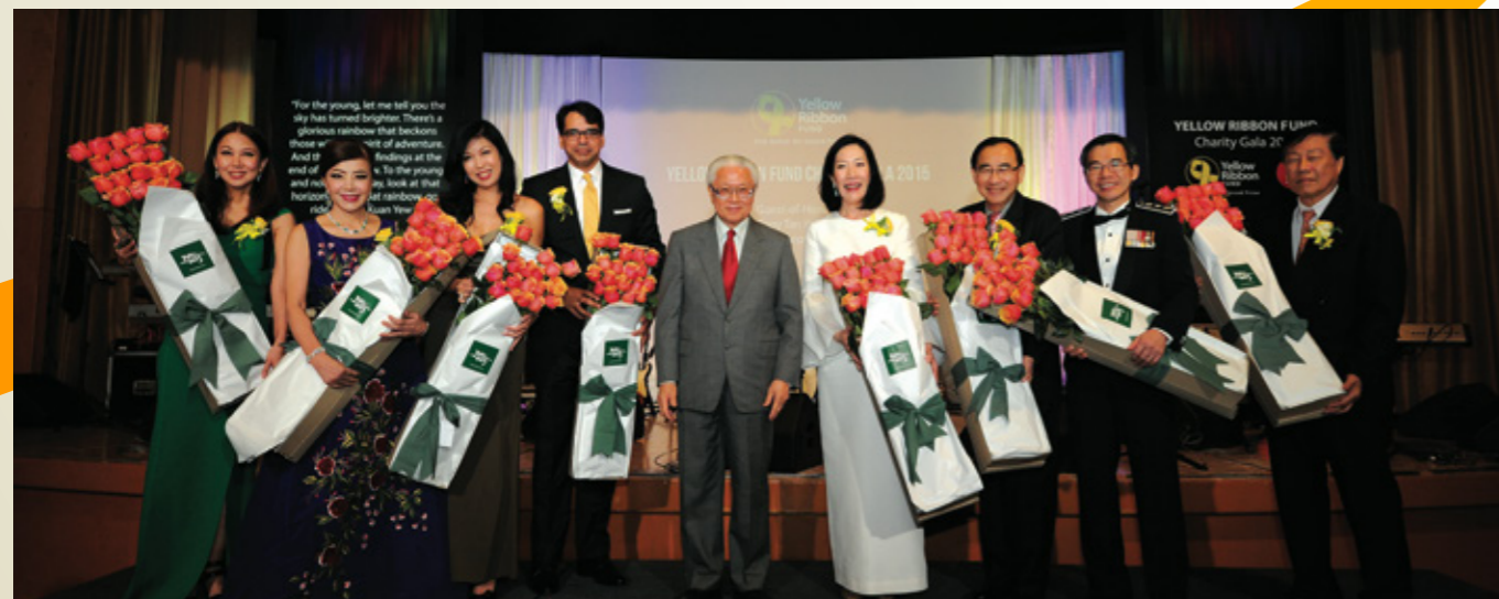
Then President of Singapore, Dr Tony Tan Keng Yam, attended the Yellow Ribbon Fund Charity Gala in 2015