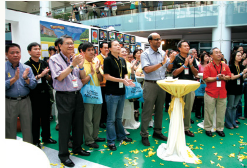
A Yellow Ribbon Journey Exhibition titled “Our Crossroads” was held at Marina Square, graced by then Minister for Finance, Mr Tharman Shanmugaratnam

A Yellow Ribbon Journey Exhibition titled “ Our Crossroads ” was held at Marina Square. More than 5,000 visitors learnt about the issues and challenges affecting inmates, ex-offenders and their families.