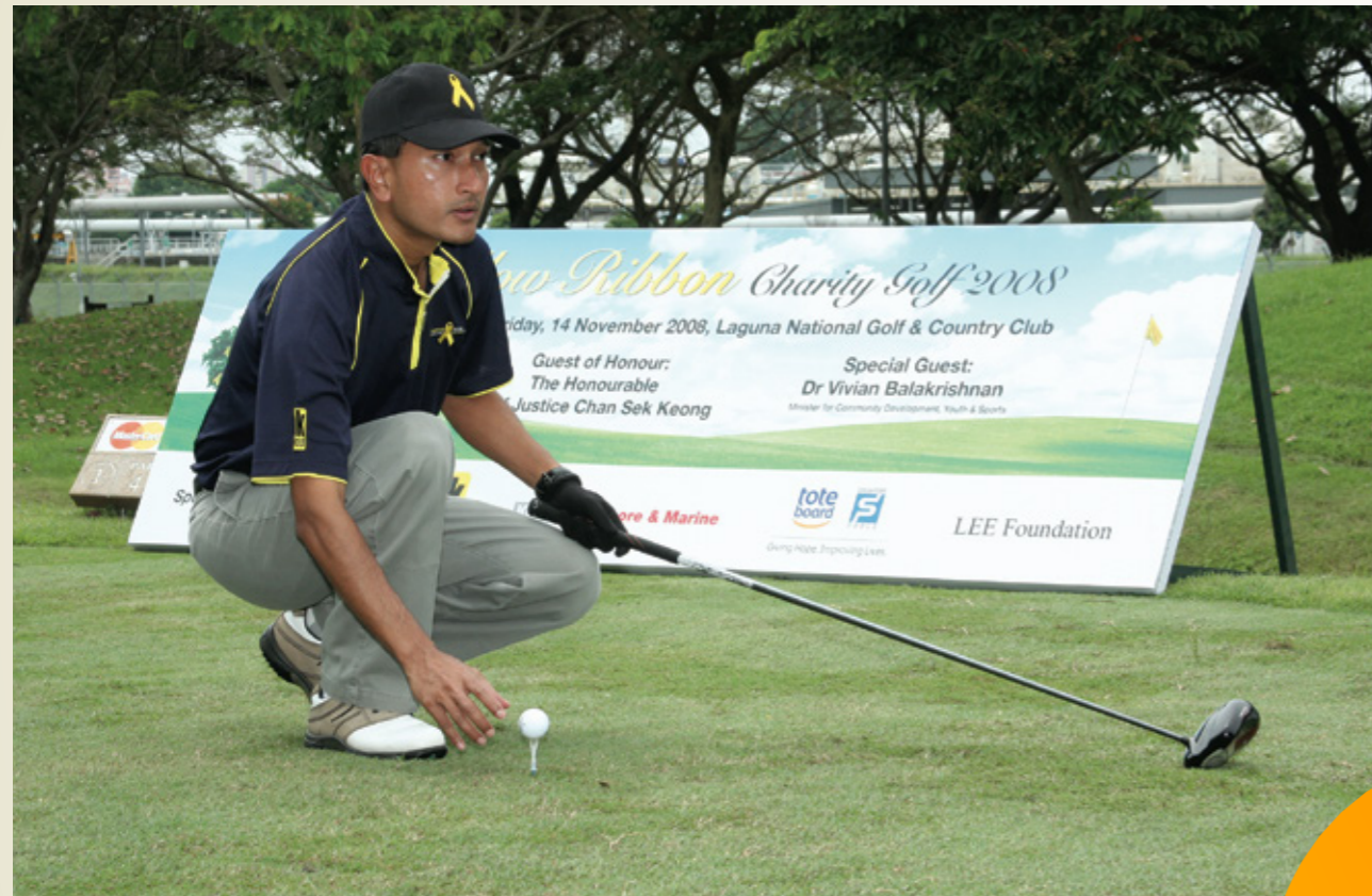
Dr Vivian Balakrishnan, then Minister for Community Development, Youth and Sports, at the Yellow Ribbon Charity Golf Tournament

The first Yellow Ribbon Charity Golf Tournament was held to raise funds for the Yellow Ribbon Fund. It consisted of a golf tournament and an appreciation dinner for participants of the tournament, donors and sponsors.