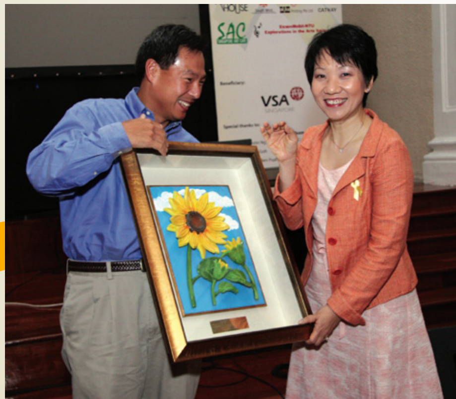
/ The Yellow Ribbon Community Art Exhibition was attended by then Minister of State, Ministry of National Development, Ms Grace Fu

The Yellow Ribbon Project received the Honourable Mention for Outstanding Achievement in Public Relations Campaign from the United Nations Department of Public Information.