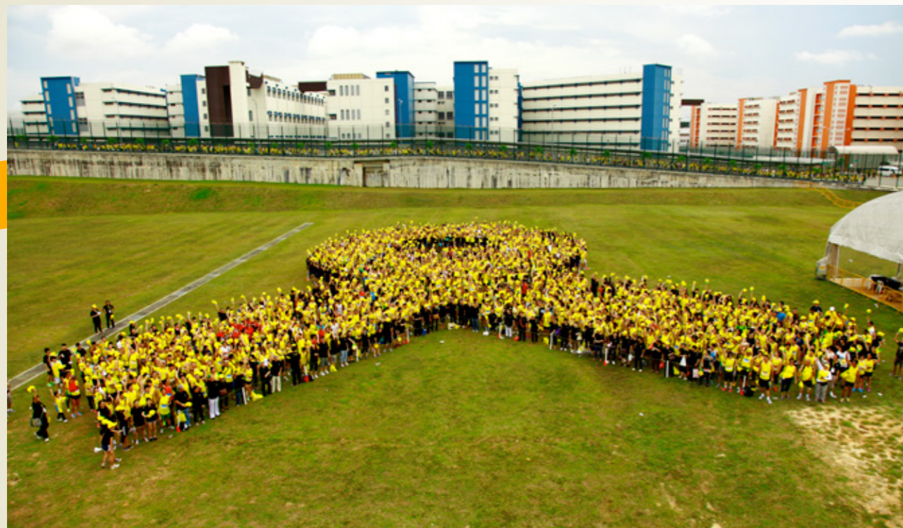
/ The Giant Human Yellow Ribbon Formation

In 2013, 1,230 runners came together to form a Giant Human Yellow Ribbon Formation . This effort helped 2013's edition of the Yellow Ribbon Run to raise more than $130,000 for the Yellow Ribbon Fund. The strong show of support from all walks of the community was testament to how the message of the campaign has permeated into the hearts and minds of society.